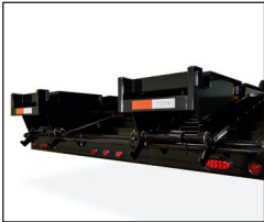
Shown with Optional Heavy-Duty I-Beam Gooseneck