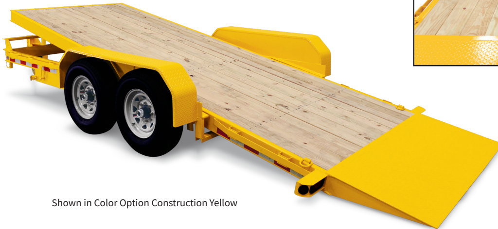
Shown in Color Option Construction Yellow